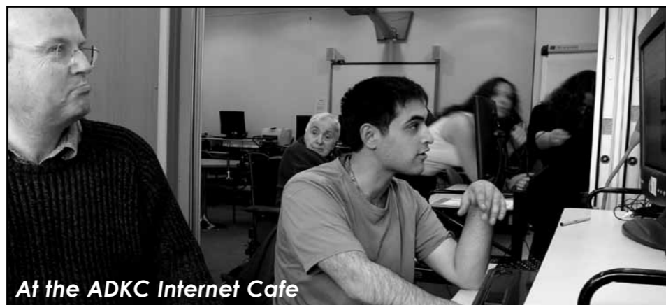
At the ADKC Internet Cafe

Please contact ADKC on 020 8960 8888 for more info on any of these activities.